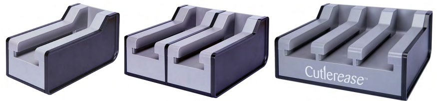
CEASESINGLEBASE CEASEDOUBLEBASE CEASEBASEUNIT